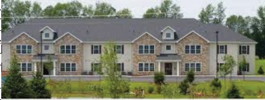
Homesteads on Ampersand, Plattsburgh

Homesteads on Ampersand is located at the foot of Consumer Square Shopping Center and just a short walk to shopping along the Route 3 corridor and to SUNY