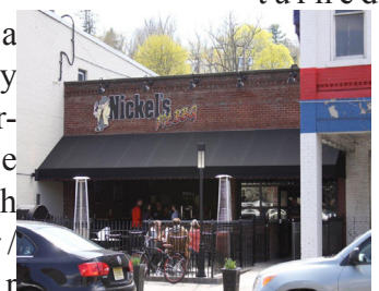
Brewpub & BBQ

into a brewery and bar because pit with indoor/outdoor seating.